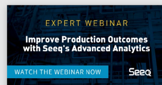
Webinar: Improve Production Outcomes with Seeq's Advanced Analytics