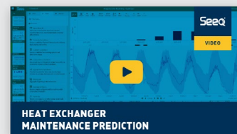
Video: Heat Exchanger Maintenance Prediction