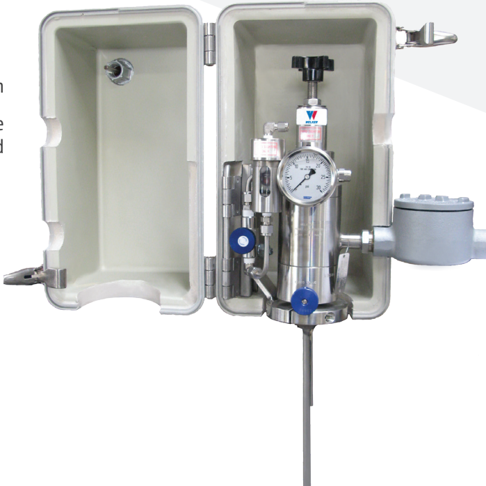
R: P<sub>2</sub> Electrical Connection Option Shown

Product and/or components are manufactured under US Patent: 6,764,536 and 7,471,882